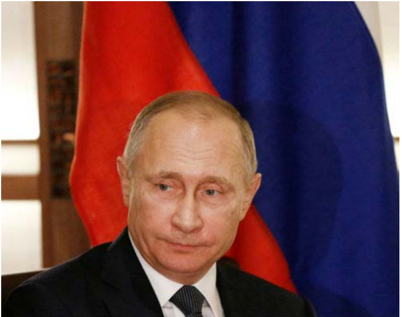
Toru Hanai/AP | Caption

The latest twist in the hacking scandal adds uncertainty to the nations' complicated relationship.